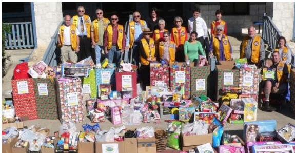
Spring Branch-Bulverde Family Lions holiday toy & food drive

To empower Lion volunteers to serve the greater Spring Branch and Bulverde area, meet local humanitarian needs, improve residents' quality of life, encourage peace, and promote international understanding.