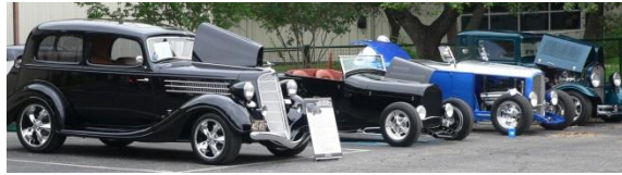
"SBB Lions Annual Classic Car Show; last Saturday in March"

We try to have fun completing fundraising projects, and seek others to join in and add to the community spirit. The Spring Branch-Bulverde Lions Club (SBB Lions) was chartered in 1991 as a family club, opening its doors to the men, women, and children of Spring Branch, Bulverde, and surrounding communities.