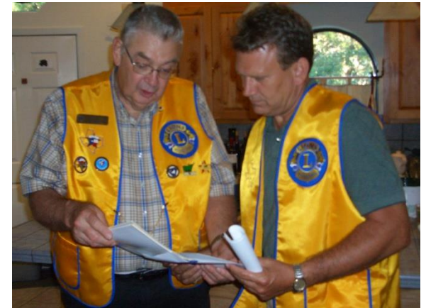
"No one can do everything, but everyone can do something."

We invite you to join us in our work to better our community's quality of life.