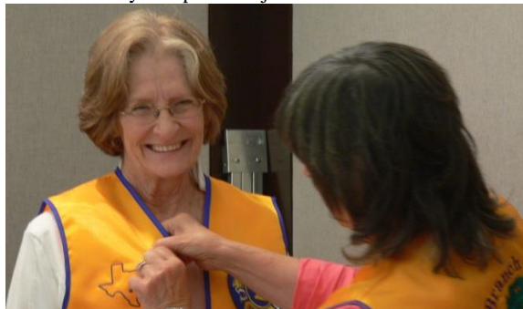
Welcome to the Spring Branch-Bulverde Family Lions Club

Individually and together, we Lions take on projects as varied as St. Jude's Ranch for Children, toy drives, vision projects, and cleaning up Bulverde's community park; we also develop community business relationships, and fulfill unmet community needs. Our Spring Branch-Bulverde Lions Club invites you to join us. We are a family club and we also invite your spouse to join us.